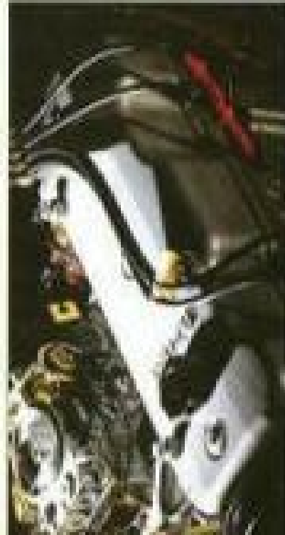
High-powered 1817 cc, 76 HP turbocharged ISUZU engine. Quick responses for a smooth, effort-free drive.

Setting standards in performance and comfort. Come, experience the difference.