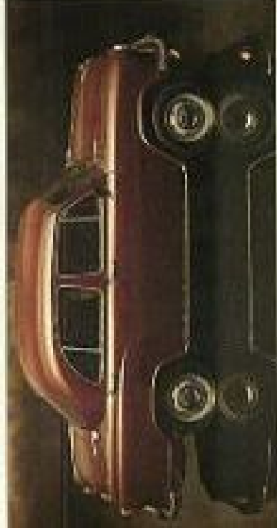
Dip primavera done to prevent rusting and enhance body life.