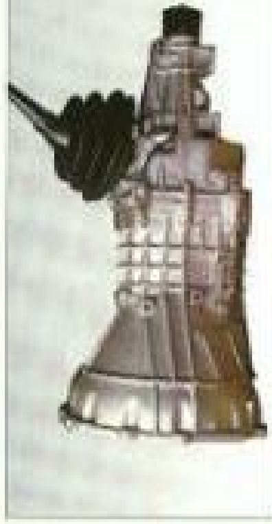
3 forward speed all-synchronized gears with an Over-drive to allow the driver to shift gears.