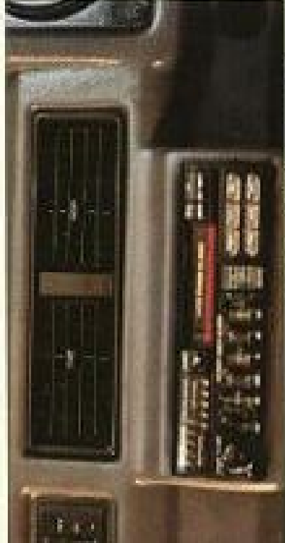
Factory-fitted air conditioner or BLU-ACC and BE-A-C options. Also provision for music system and clock.