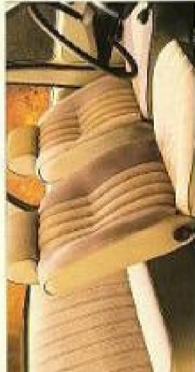
Easy adjustable (reclining & sliding) bucket seats (with plush velvet upholstery) to enhance driving comfort.